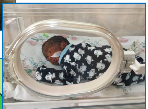
A new premature baby who arrived this week.