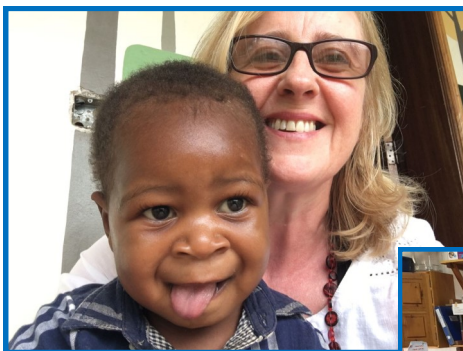
A new friend!

'I've had a great time so far! I've been learning a lot of paediatrics from the other two Doctors working here. The children arrive, often very unwell, dehydrated and many are malnourished. The staff here at Potters Village do an amazing job. We are open 24/7, so babies, children and some adults appear at our medical centre at any time of the day or night. There are no appointments.'