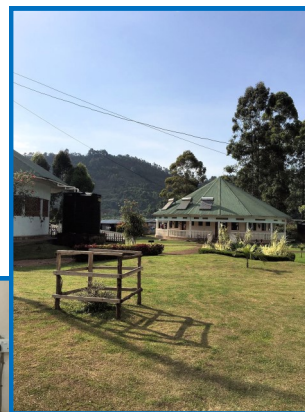
The Medical Centre