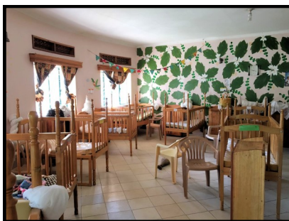
THE PAEDIATRIC WARD

The nurses are highly skilled and competent to manage many cases. Sadly the free government hospitals in Uganda are very under funded. As a result maternity care is not what it could be and new-borns arrive at Potter Village often in a poor state, needing resuscitation. The crisis centre had a regular influx of babies who had either been abandoned or their mothers had died in childbirth. These children are cared for beautifully until they can be returned to extended family members or fostered before the age of two.