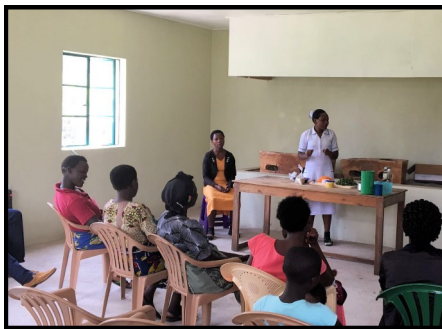
A COOKERY DEMONSTRATION IN THE MALNUTRITION UNIT.

The nurses are highly skilled and competent to manage many cases. Sadly the free government hospitals in Uganda are very under funded. As a result maternity care is not what it could be and new-borns arrive at Potter Village often in a poor state, needing resuscitation. The crisis centre had a regular influx of babies who had either been abandoned or their mothers had died in childbirth. These children are cared for beautifully until they can be returned to extended family members or fostered before the age of two.